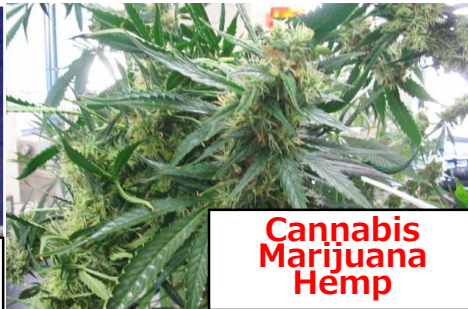
Cannabis Marijuana Hemp