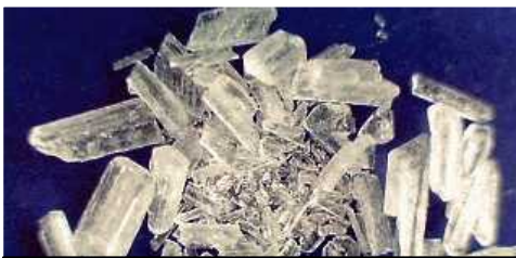
Stimulants Methamphetamine Amphetamine

Don't even think about bringing drugs to JAPAN !