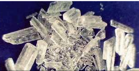
Stimulants Methamphetamine Amphetamine

Don't even think about bringing drugs to JAPAN !