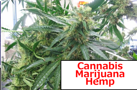
Cannabis Marijuana Hemp