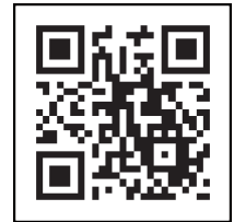
COVID-19 Vaccine Navi secondary code