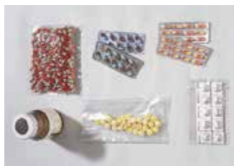
■ Psychotropic drugs