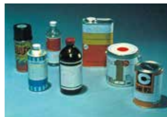
■ Organic solvents (thinners, toluene, etc.)